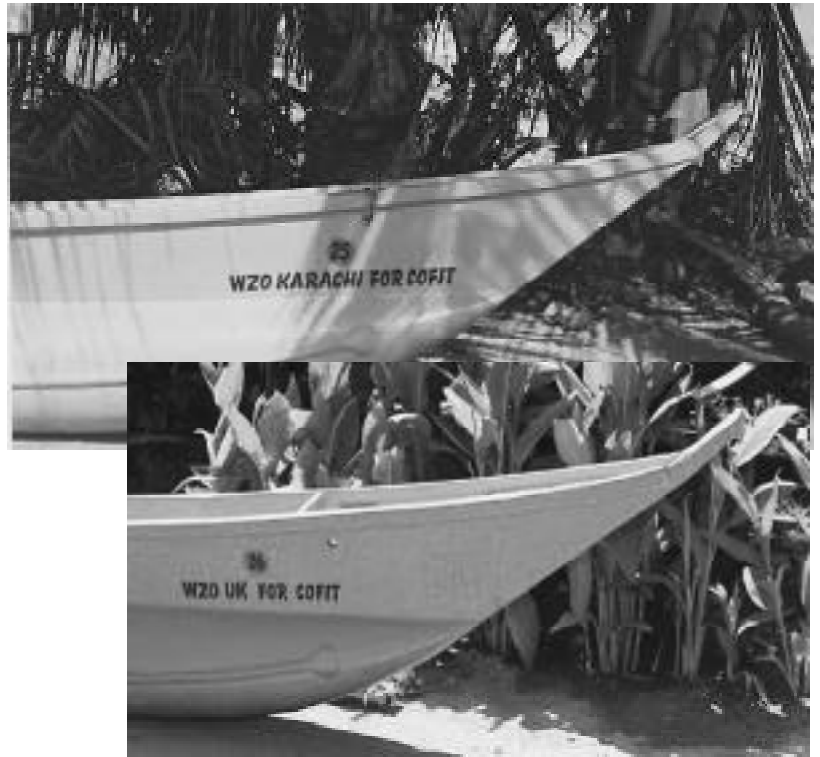
The fishing boats named after the donors, as a tribute of thanks - p 67