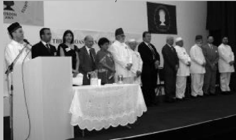
Opening ceremony - photo courtesy ZTFE