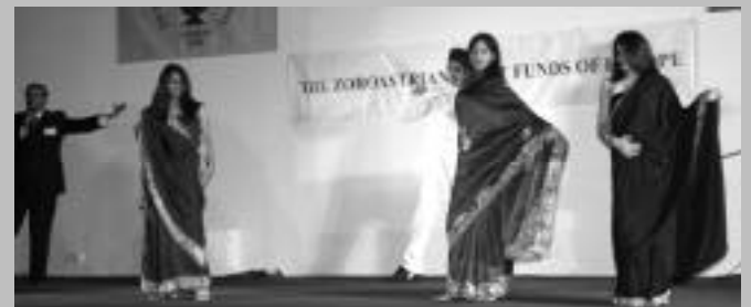
Fashion Show in the evening which was part of the entertainment