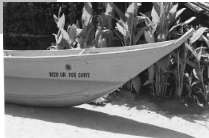
Two of the new fishing boats named after the donors by Sunari Senaratne

Our long-term goal, it was clear, had to be the resuscitation of the fishing industry combined with the regeneration of complementary livelihoods. Accordingly, my daughter and I, as the development specialists, devoted our energies to the restoration of boats, equipment and nets. My wife set up a "clinic", issuing numbers and working round the clock, in order to see as many as possible, mainly women, who besieged our offices and thronged outside the gates.