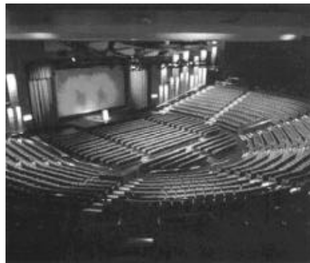
Wembley Conference Centre

The poor delivery of some of the speakers or the shallow content of some their talks left me wishing that some system of vetting existed beyond a collection of committee members who may not be aware of the calibre of person they were deciding about.