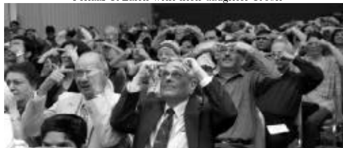
Audience reflection on meditation, purpose being to demonstrate the use of asha to reach out instead of pointing out.