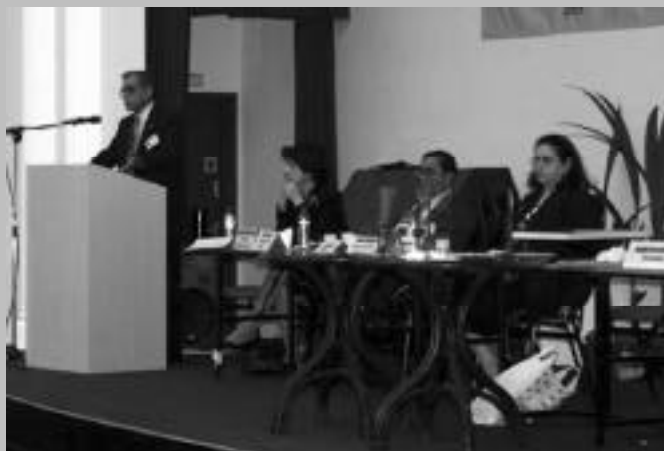
Some members of the WZCC