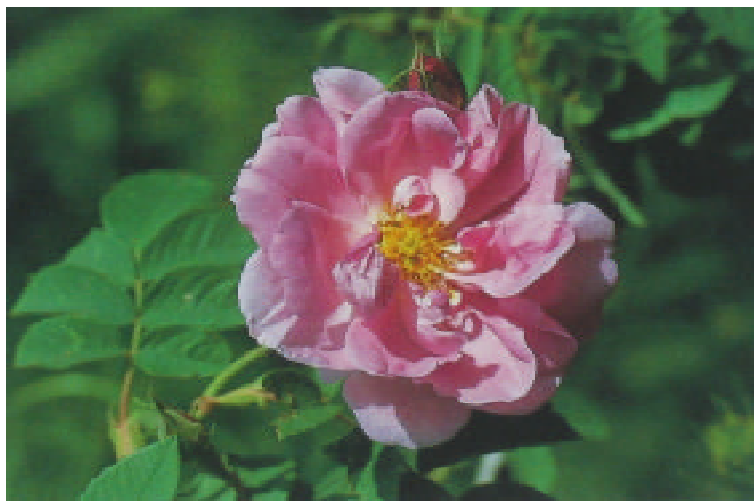
Courtesy, "Gardens of Persia" by Penelope Hobhouse, San Diego, 2003; photo by Jerry Harpur

A member of the botanical family Rosaceae and the Genus Rosa, it has been identified as a wild flower even in fossil form. The original 'true' rose looks quite different from the multi-layered cultivated rose we are so used to admiring in modern times. The bulky ovary, the "rose hip" has on its rim five sepals, which alternate with five petals. This arrangement of a single row of petals remains a common arrangement. In its early young stage the single layer of delicate petals are well laid out in a circular row but in a fully mature rose the petals become thick and broadened, thus overlapping each other (as in the photo). In many varieties of 'cultivated' roses the stamens in the middle of the flower become petal-like, too, creating multiple layers.