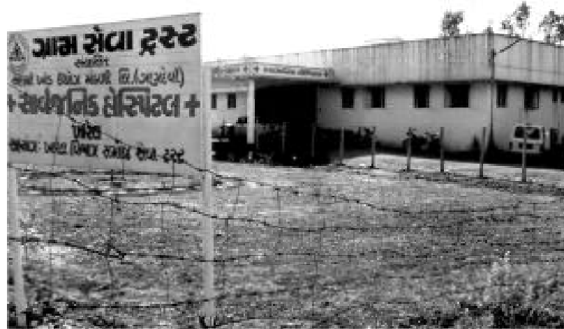
Gram Seva Trust Hospital 1995. Photographs are from the GST Powerpoint presentation.

If I can ease one life the aching, or cool one pain, or help one fainting robin into its nest again, I shall not live in vain.” Emily Dickinson