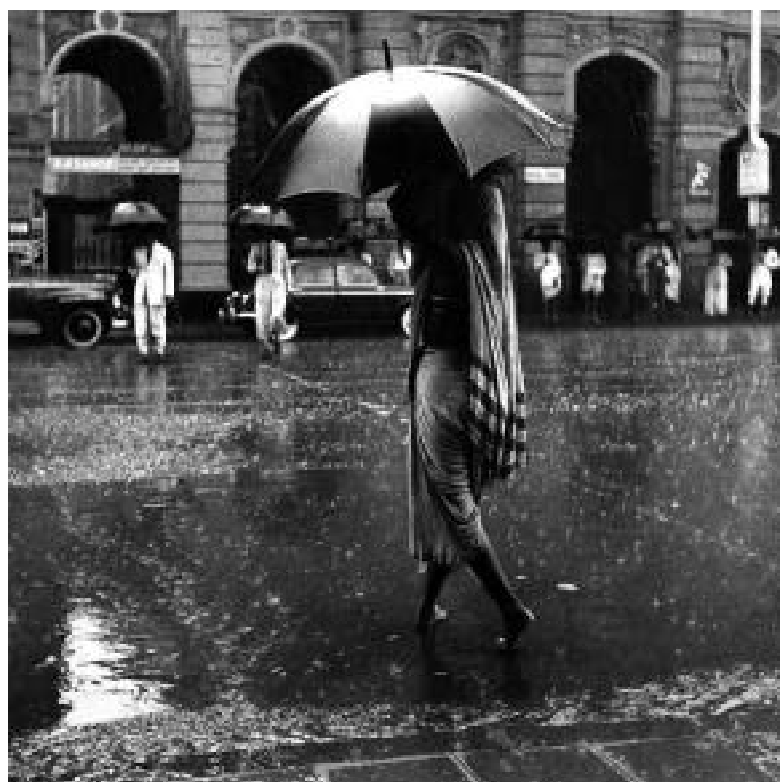
Coolie Woman, 1948 monsoon, Bombay, India