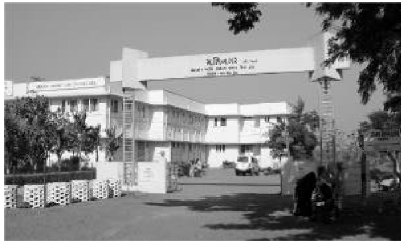
Gram Seva Trust Hospital after 2003